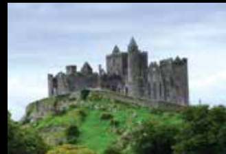
Rock of Cashel