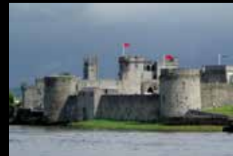
King Johns Castle